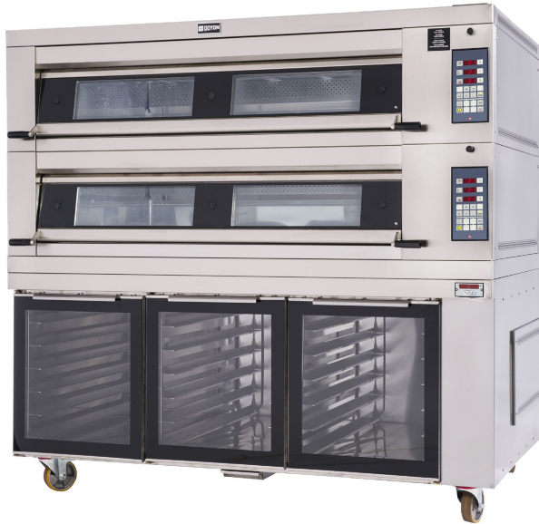
*SHOWN IN 4T2 w/ OPTIONAL PROOFER