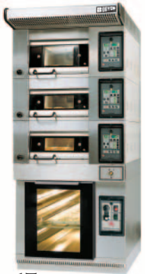
1T 1 pan (shown with optional proofer and optional canopy)

(Modular baking chambers available on special orders)