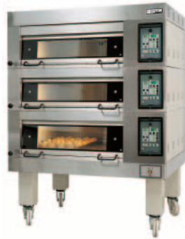
2T 2 pans