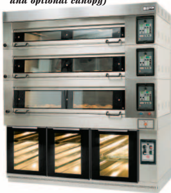
3T 3 pans (shown with optional low profile proofer)